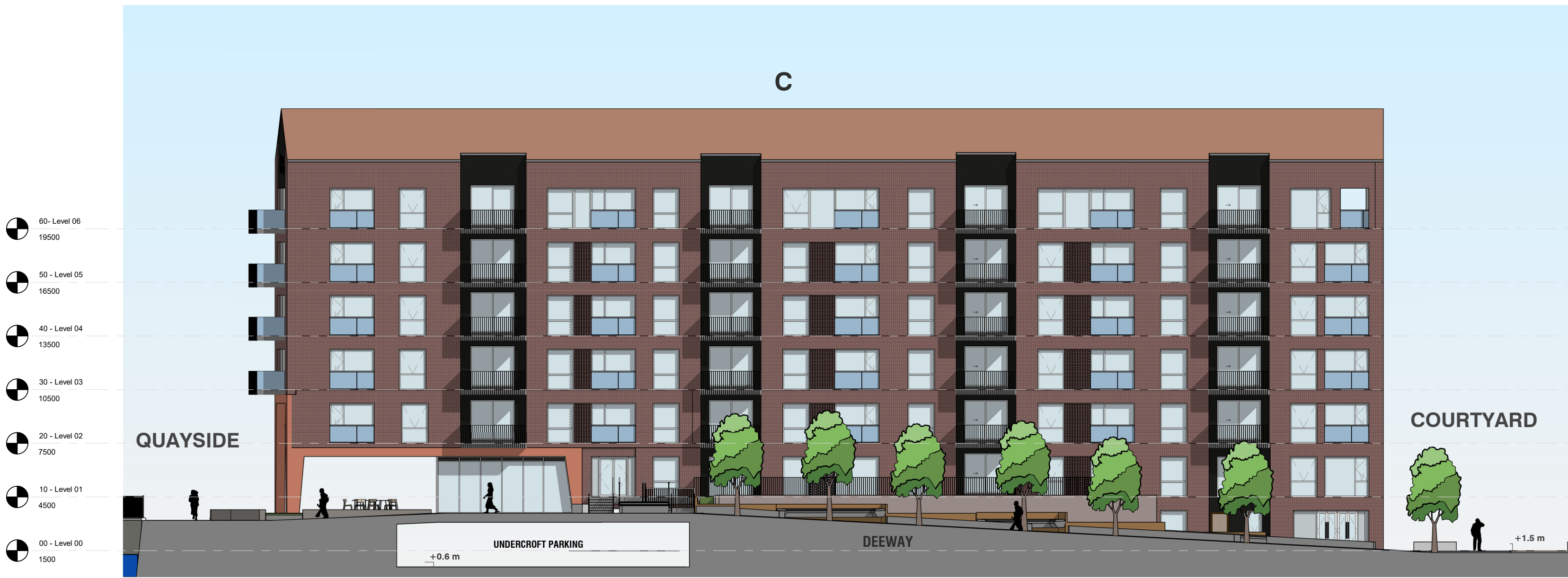
Block C South Elevation 1 : 200