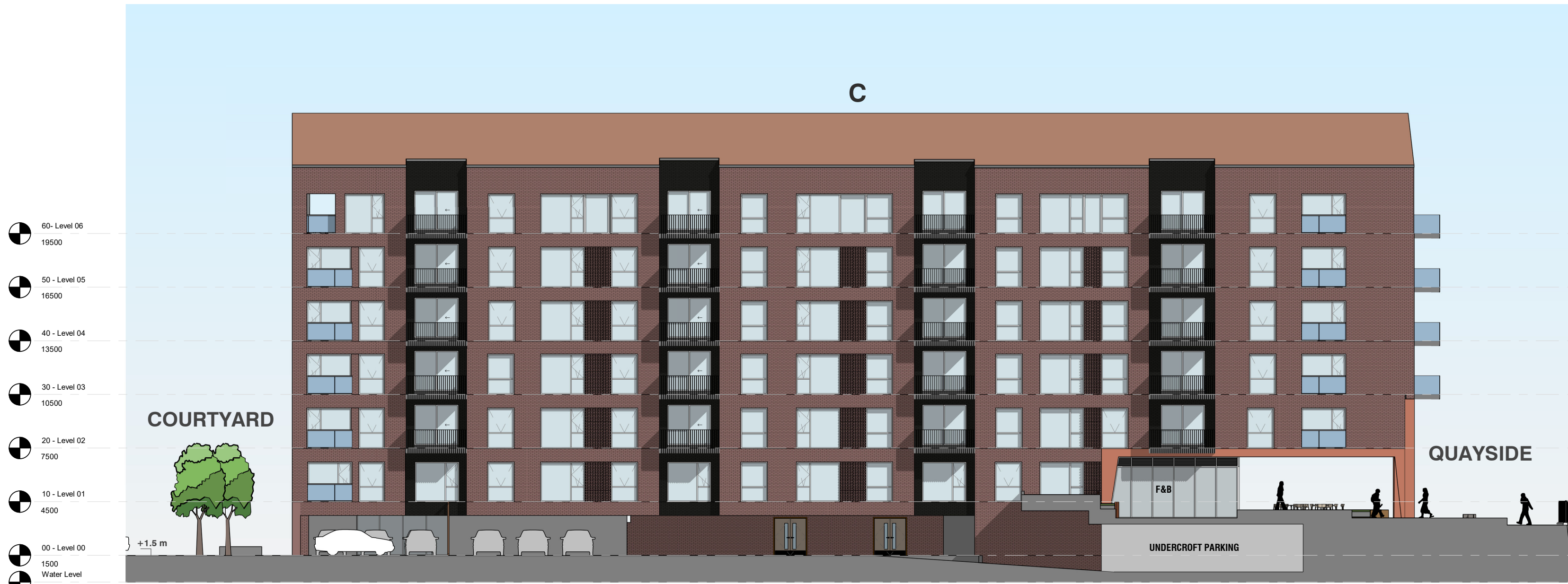
Block C North Elevation 1 : 200