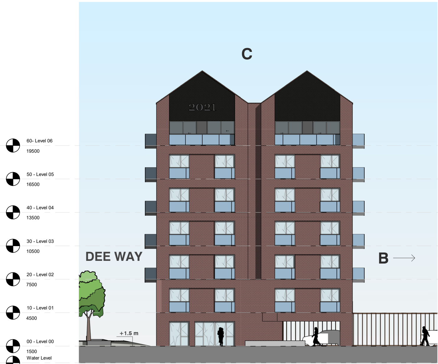
Block C East Elevation 1 : 200